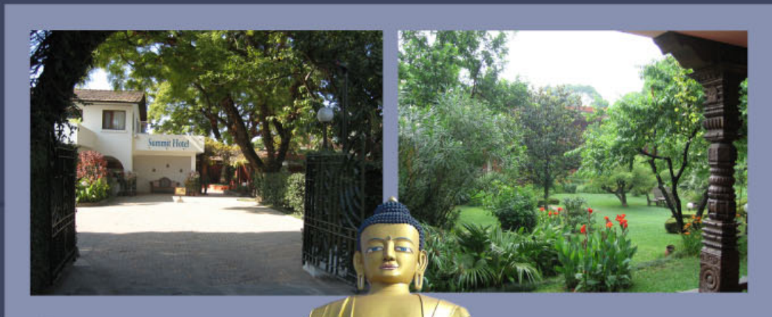
Views of the hotel

Participants are accommodated in a beautiful hotel in Patan just minutes from all the wonders of Kathmandu. All rooms have en suite bathrooms, covered terraces facing onto the gardens and you can choose single or twin shared rooms. The Hotel runs a very popular cafe, bar and restaurant - so good refreshments and company are always available.